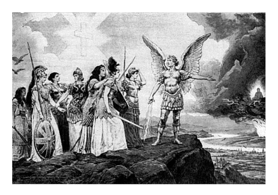
Fig. 1.8. Kaiser Wilhelm and Hermann Knackfuss, "The Yellow Peril" (lithograph, 1895).

Wilhelm II provided, completed an infamous lithograph that shows the archangel Michael, patron saint of Germans, pointing out a seated Buddha in the "Far East" to a group of Valkyrie-like lady warriors (Fig. 1.8). The Buddha is shrouded in dark clouds that threaten to move west, where the sky is brightened by a radiant cross. For the kaiser, the ladies represented different Christian European nations, including Russia. They stand on a rock overlooking a European city containing a castle and church steeples, but beyond, where the Buddha looms, another city is in flames. The fire seems to spew from the mouth of a dragon on which the Buddha is sitting, instead of his usual lotus flower. This allegorical lithograph thus warns Christian nations of the looming threat from heathen countries in East Asia, in particular Japan.