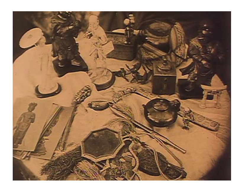
Fig. 1.3. Screenshot. A table of Oriental objects in Olaf and Eva's European home (54:57).

instruments, dolls, objects of art, and, of course, swords. This fascination with all things Oriental is integrated into the storyline of Harakiri itself. When Olaf, the Western naval officer who marries O-Take-San, the film's version of Madame Butterfly, first appears, he is seen purchasing a Japanese smoking pipe at a merchant's stall. In his European home, Japanese souvenirs are displayed on a round table (Fig. 1.3).