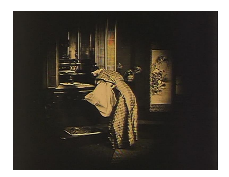
Fig. 1.4. Screenshot. The daimyo bows before a Buddhist altar before committing seppuku as the scene fades out with a typical iris shot (19:37).