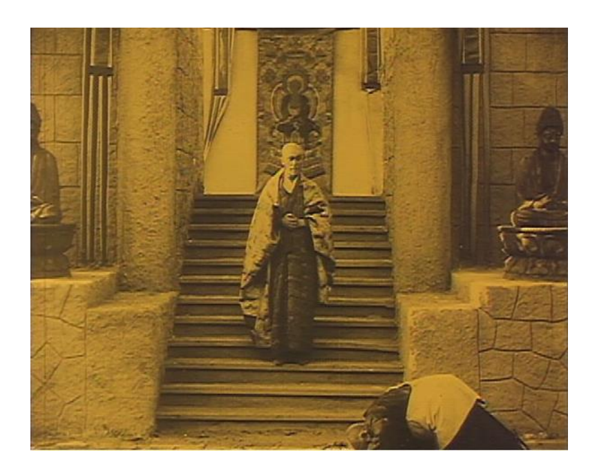
Fig. 1.6. Screenshot. First appearance of the bonze (4:17).

The film highlights the evil nature of the bonze: He is by turns cunning, sadistic, cruel, aggressive, menacing, and violent. The bonze, played by Georg John, is introduced at the center of a symmetric composition whose axis is a staircase leading up to a Buddhist temple. Buddhist iconography is visible behind the bonze, and statues of Buddha flank the entrance to the temple. As the bonze walks slowly down the stairs, his authoritative demeanor commands utter obedience, which is reflected in the kneeling bow of the temple servant, who reports that he is making sure that "no foreign feet enter the shrine" (Fig. 1.6).