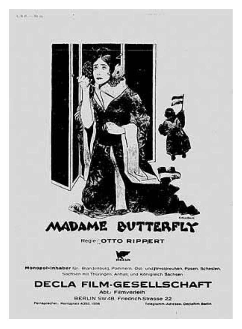
Fig. 1.1. Production Announcement of "Madame Butterfly" (Lichtbild-Bühne, June 22, 1918).<sup>5</sup>

The flag is a prop that comes straight out of Puccini's opera. During the climactic scene, a stage direction indicates, "Butterfly takes the child, seats him on a stool with his face turned to the left, gives him the American flag and a doll and urges him to play with them, while she gently bandages his eyes. Then she seizes the dagger, and with her eyes still fixed on the child, goes behind the screen." The Decla poster contains a clue to the original conception of the film. The child's flag is not an American flag, as it is in Madame Butterfly , or a Scandinavian flag, as one would expect in Harakiri , given the nationality of the naval officer in the film (in the restored