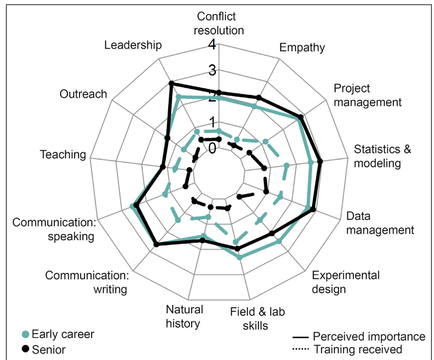
Figure 2. Perceived importance (solid lines) and training received (dashed lines) for selected skills among survey respondents. Points represent weighted average scores per skill for each career stage; responses were based on a Likert scale from 0 (not important/no training received) to 4 (extremely important/extensive training received). Colors correspond to respondent career stage while participating in macrosystems projects (teal = early career only; black = senior only).

Early career participants reported higher levels of training in all skills than did senior personnel (Figure 2; WebFigure