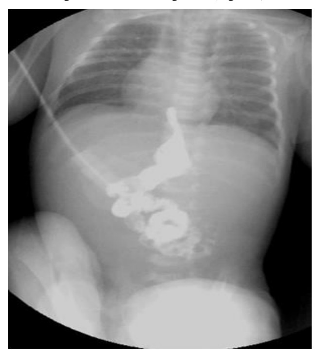
Figure 3 . Barium gastrogram through a gastric catheter 2 months after TEF ligation, showing signs of gastric enlargement and gastro-esophageal reflux on the distal esophagus ending.

and difficult in matters of enteral feeding because of the extremely small volume stomach. The barium gastrography done at 2 months through gastrostomy revealed signs of stomach enlargement (Figure 3).