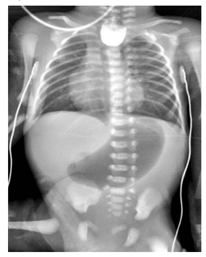
Figure 2 . Type C EA associating duodenal atresia preoperative barium swallowing, full body X-ray.

referred the case to our unit, where the diagnosis of type C EA and DA was made – the esophagogram and the plain abdominal aspect of the X-ray showed upper pouch ending at the 3rd thoracic vertebra, the presence of gaseous distension of the stomach, but not of the small bowel (Figure 2).