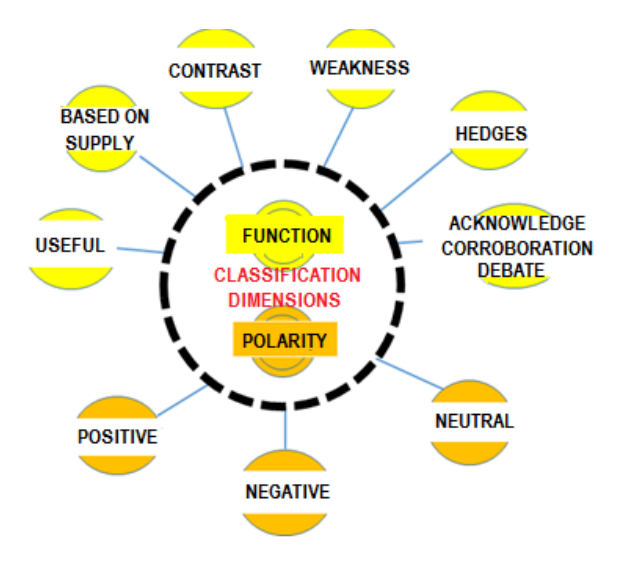
Figure 1: Function and polarity classification levels.

Results for Inter-annotator agreement will demonstrate that our scheme is easy to apply. Annotators are able to take advantage of all possibilities of classification, because they need to understand and remember only six functions clearly defined and three levels for polarity; as opposed to what happen with complex ontologies as CiTO, where coders have to apply 92 object properties.