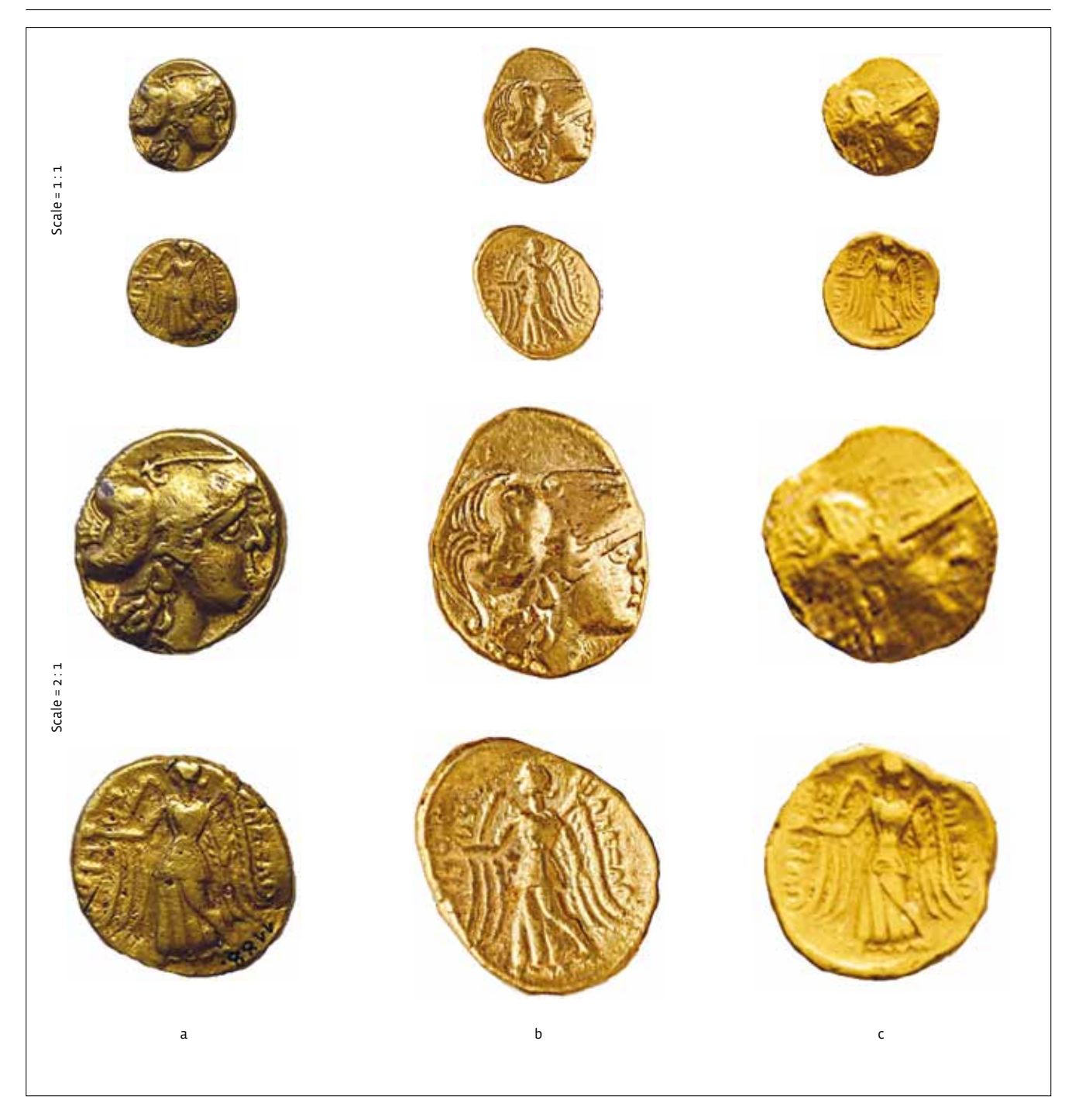
FIGURE 2. Direct analogies for the coin from the vicinity of Radoboj: a) Radoboj; ZG 1188; 8.46 g; 17 x 19 mm; 12 h; b) Frauenberg, 8.47 g; 23 x 18 mm; 12 h (Schrettle, Peitler 2019, 31, Abb. 1a-b); c) no provenance data; Staatliche Münzsammlung, München, MC 1208; 8.52 g; 19.6 mm; 12 h (Militký 2018, I:o5.1/8(1).

A detailed comparison of imitations of Alexander's gold staters from this area shows that the coin from the vicinity of Radoboj, and coin no. 1 from Frauenberg, can be classified into the same eighth variant of the fifth group of imitations as the coin without provenance that is kept in the Staatliche Münzsammlung in Munich. 59 Both the coin from the vicinity of Radoboj and coin no. 1 from Frauenberg were minted with the same die for the reverse of the coin with which the coin from Munich was also minted.