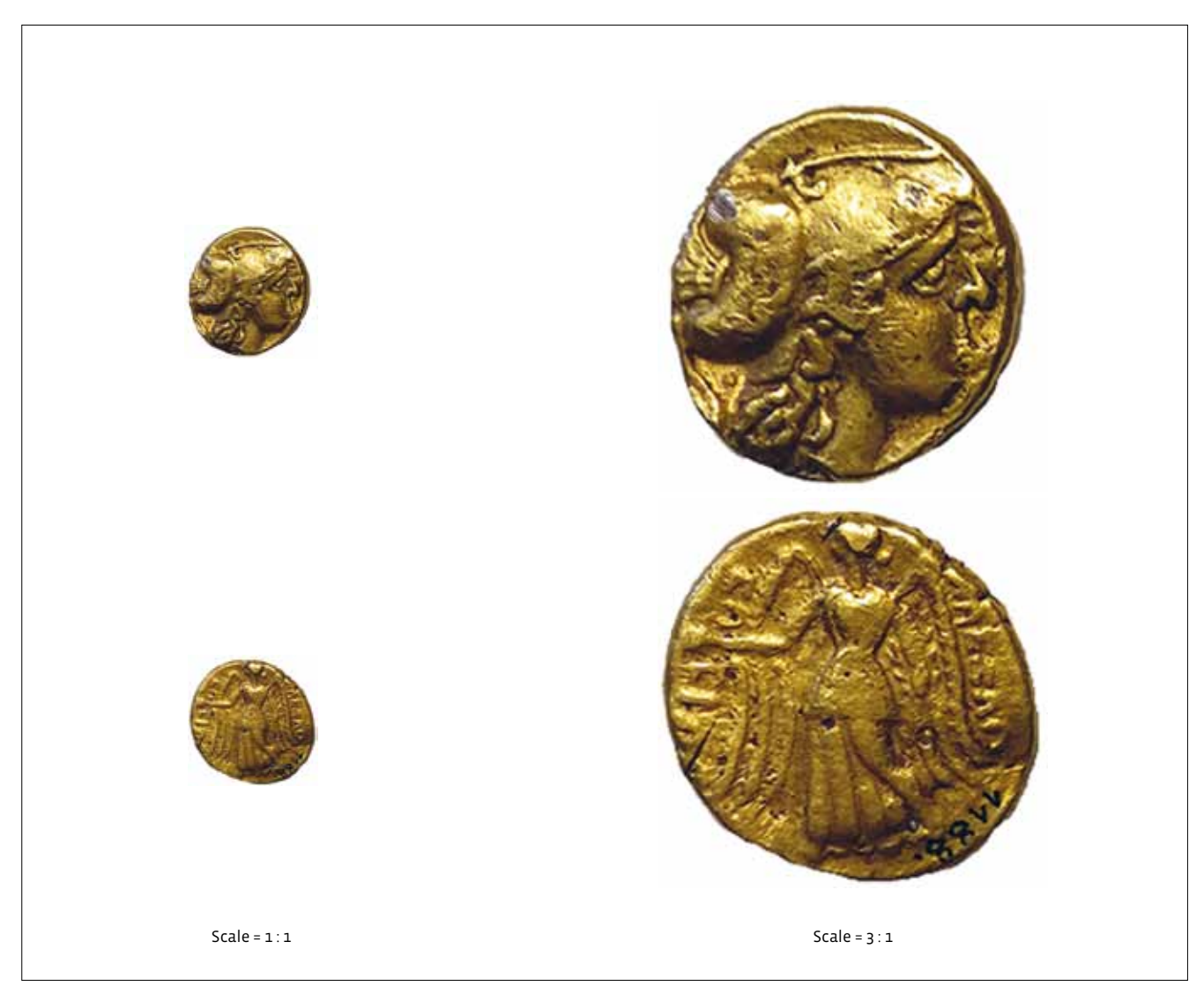
FIGURE 1. The obverse and reverse of the coin from Radoboj.

Undoubtedly, the gold coin from the vicinity of Radoboj is an imitation of an Athena/Nike stater of the Macedonian king Alexander III (336–323 BC). The depiction of Nike on the back of the coin is of quite primitive execution, and the letters on the inscription on the right and left edges of the coin further indicate that the die cutter was not proficient in Greek script.