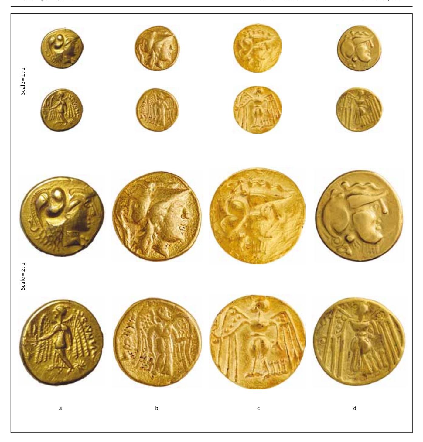
FIGURE 3. Celtic gold coins from the area south of the Mura and Drava rivers: a) Ludbreg; ZG 4674; 8.21 g; 17.5 x 18.5 mm; 1 h (photo by I. Krajcar); b) Frauenberg; 8.45 g; 19 mm (Schrettle, Peitler 2019, 32, Abb. 2a-b); c) Varaždin; ZG 13427; 7.84 g; 20 mm; 9 h (photo by I. Krajcar); d) Podzemelj; Belokranjski muzej, Metlika 7254; 7.85 g; 20 x 19.5 mm; 9 h (photo by M. Pavlovec).

Hence, it is now possible to add six sites to the already known twenty-six sites of discoveries of imitations of Alexander's staters.