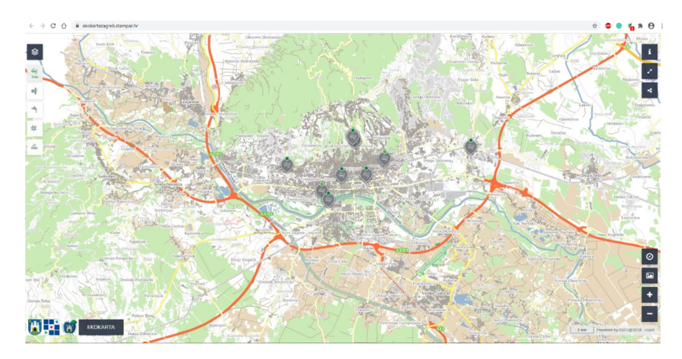
Figure 2. Web GIS app 'Environmental Map of the City of Zagreb', 'air' interface

The data from the specific purpose measurement station at Mirogojska location indicate that since the introduction of strict self-isolation measures, significant decreases in nitrogen dioxide concentrations (NO<sub>2</sub>) have been observed in the air. Although a decrease of small floating PM2,5 particles could also be expected, a significant reduction is still not possible to detect. This is probably since the main sources of PM<sub>2,5</sub> are diverse, while the main source of nitrogen dioxide (NO<sub>2</sub>) is road transport.