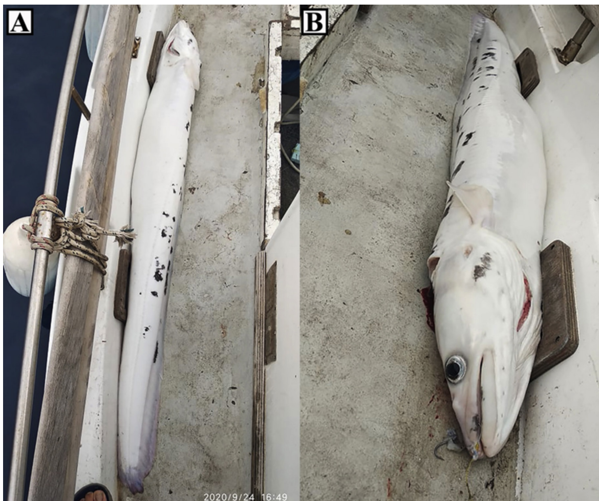
Fig. 3. The white specimen of C. conger (A) collected NE off the Andros Island (Aegean Sea) on 24 th September 2020 and particular of the head (B)

this phenomenon and its relationships with size, environmental factors and/or genetics. However, a curious fact is that this characteristic was never reported in literature.