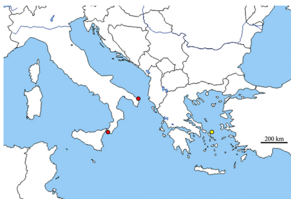
Fig. 1. Study area in the central (Italy) and eastern (Greece) Mediterranean Sea. Red circles indicate locations where the specimens of Epinephelus costae were caught (Alimini, Adriatic Sea) and photographed in situ (Pellaro, Strait of Messina); the yellow circle indicates the location where the white specimen of Conger conger was caught (Andros Island, Aegean Sea)

Unfortunately, the fish was sold at the market and further detailed analyses were not possible.