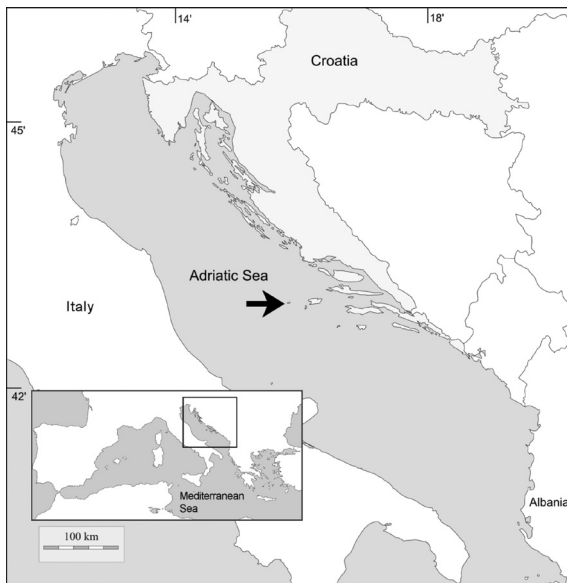
Fig. 1. Geographical map with the collection locality