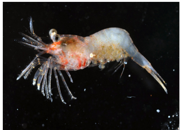
Fig. 2. Examined ovigerous female specimen of Eualus drachi Noël, 1978 (f, T.L. 14.73 mm; C1685)

All three examined specimens matched an original morphological and ecological description of Eualus drachi Noël, 1978 (NOËL, 1978). Two out of three examined specimens were ovigerous females and one specimen was an adult male. The found ovigerous state for this species correlates with the already recorded ovigerous period for the other adriatic Eualus species (FALCIAI & MINERVINI, 1992). Total lengths of the specimens (from the peak of the rostrum to the end of the telson) were as follows: spm1 - ovigerous female, 14.73 mm (Fig. 2); spm2 - adult male, 12.03 mm; spm3 - ovigerous female, 13.24 mm. These lengths fall in the known range for the species provided by NOËL (1978).