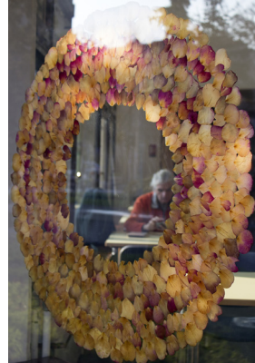
Fig. 5

In this way, the work literally became incorporated and inscribed as a structural part of the library, and simultaneously a zone that separates the inner institutional space from the outer public one both spatially and symbolically. It is exactly at the point of their interference that the question of LGBT identities is made present: the glass diaphragm of the windows thus lost its representational function though the deconstruction of the garden as microcosm, as Foucault's heterotopia of symbolic perfection, which is elusive in this case, and becomes a substitute, reflection, and its negation. Presented in the form of a modernised herbarium – refracted through the representative form displayed