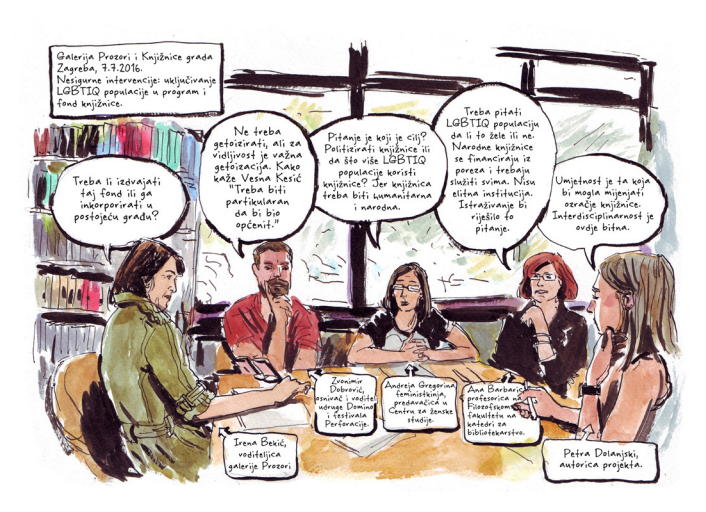
Fig. 3 Illustration by Helena Janečić