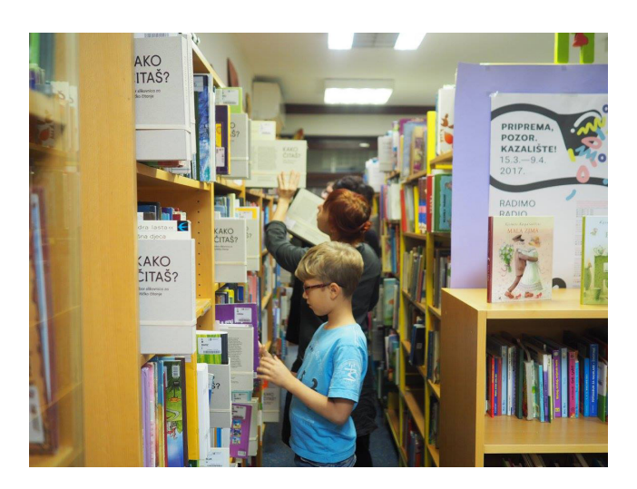
Fig. 2 Prozori Gallery team

The work by Ana Kuzmanić is also interesting as an example of direct interference of critical librarianship and contemporary art which, along the lines of critical pedagogy in an interdisciplinary collaboration with experts in children's literature, questions picture books as social representations and pedagogical paradigm intended for children. With an authorial selection of picture books intended for critical reading, which she includes in library holdings thus supplementing them with her donation, she introduces the focus on different pedagogies through art (Fig. 2).