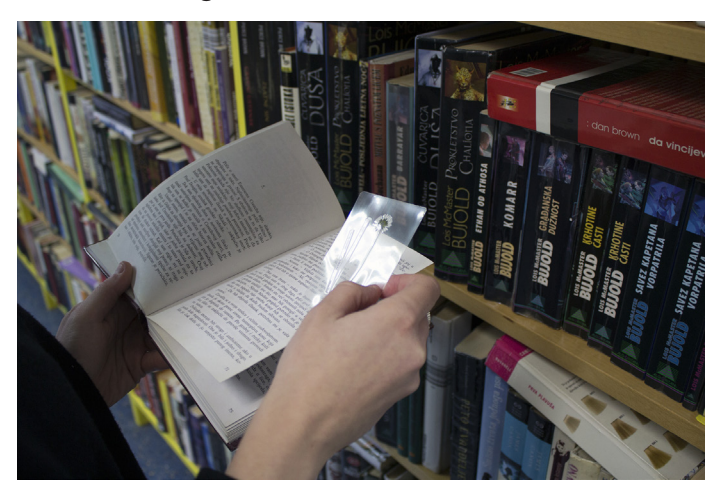
Fig. 6 Prozori Gallery team

on the windows on the one hand, and through the minimalist intervention of the bookmarks hidden in books on the other hand (Fig. 6), Vujičić's approach to the subject includes, apart from the conceptual dedication, also a scientist's dedication to the subject of study, the laboratory conditions that require a fully-planned, detailed, precise approach to work, the delicacy in the processing of fragile artistic material that is exposed to disintegration and is simultaneously interpreted as a carnal moment and a poetic depth that mediates and organises a new manner of viewing.