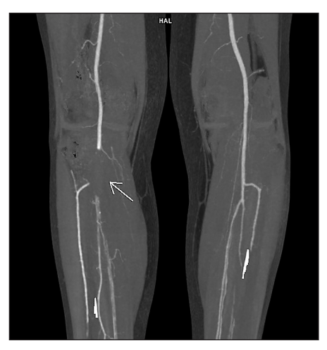
Figure 2. CT angiography of peripheral arteries: Coronal MIP reconstruction shows thromboembolic occlusion of both deep femoral arteries (A, arrows) and occlusion of the right popliteal artery (B, arrow).

As far as we know the available literature reported respiratory symptoms either before or after aortic thrombosis onset. However, our patient never manifested any respiratory symptoms or fever, and she had a large thrombus burden without a history of known atherosclerosis, prothrombotic disease or atrial fibrillation. The pathogenesis of hypercoagulability in COVID-19 is still unclear. It