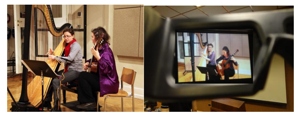
Figure 1 Musicians in the Studio (left) and Remote View via 3D Glasses (right)

One of our first works in the field of culture was the live transmission of a harp and guitar concert in 3Dfrom Czech Republic to the US. The goal was to create an illusion for remote visitors as they had been sitting in the concert hall close to the musicians.