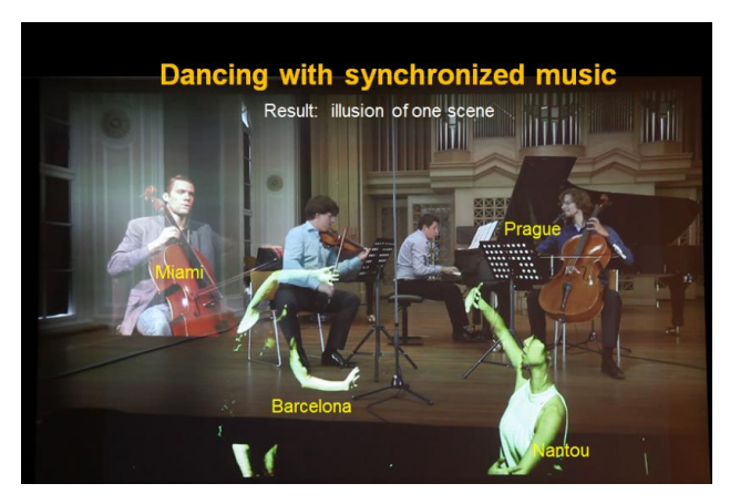
Figure 3 Global Performance for APAN38

A slightly different GP was prepared for the APAN38 held in Taiwan. The performance was called "Dancing in Space". We again collaborated with partners across continents. In this case, one big screen was used to compose video of musicians and dancers together. The main video of a musical trio was transferred from Prague and into it was composed live video of a cellist who played in Miami (US) and dancers who danced in Barcelona (Spain) and in Nantou (Taiwan). The final screen from this performance is shown on Figure 3.