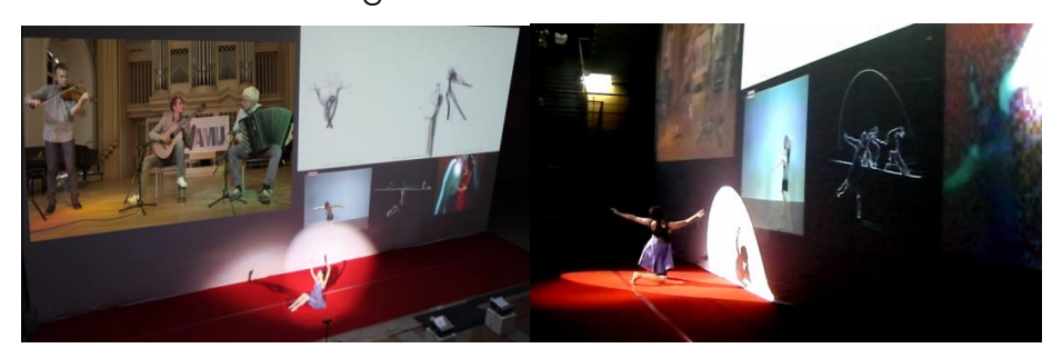
Figure 2 Two Views of Final Stage of the Global Performance for APAN36

During a preparation phase, the director decided to create a more complex scene in Daejeon. The final big screen (size 16x6,5 m) was split into several regions. Each of these regions was dedicated for different video. The left half of the screen was for musicians from Prague with 4K projection. The upper part of the right region was dedicated for a joint dance of Avatars and below them there were projected three original videos of dancers sent from different sites. The performance got true interesting expression when a Korean dancer performed live dance directly in front of the screen. The whole performance had a perfect illusion of a compact live local performance. The audience was approx. 100 people in Daejeonat the conference closing session and additional participants in other locations. The big screen with all videos in the venue in KR is shown in the illustration in Figure 2.