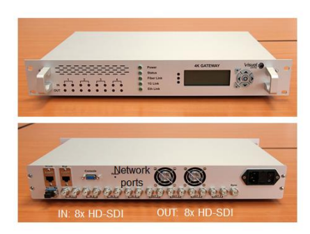
Figure7 MVTP-4K Box Enabling Multiple Video Transmissions