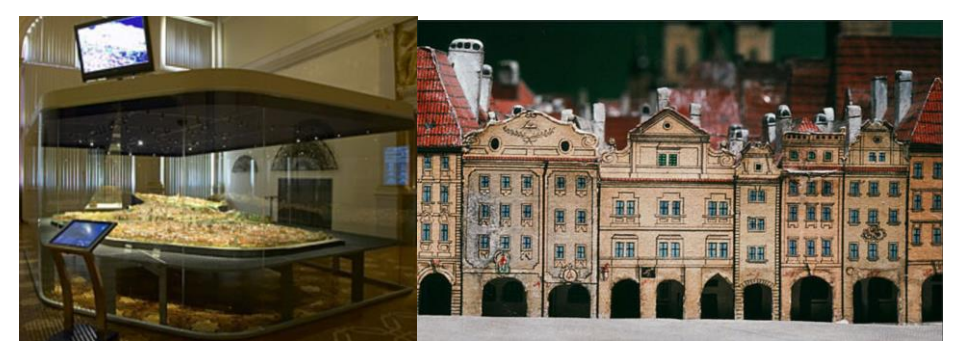
Figure 4 Langweil Model in Prague Museum (left) and Zoomed Details (rights)

Source: Photographs are a reproduction of a collection item administered by the City of Prague Museum, the author of the item is Antonin Langweil