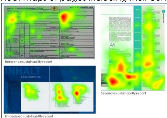
Figure 2 Heat maps of pages including their contents (absolute duration)

*Note: Absolute duration is calculated by the duration of fixations, whereas the warmest color represents the highest value.