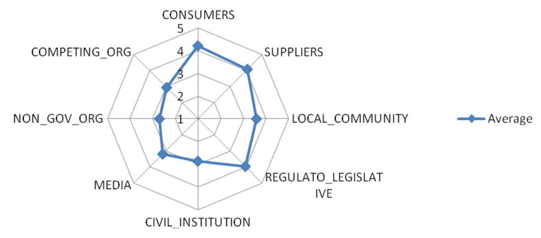
Figure 2 Quality of Relationship with Stakeholders' Groups

legal frameworks and guidance for behaviour on foreign markets. Figure 2 presents average values for quality of relation with stakeholders' groups among sampled organizations. Relationship with other secondary stakeholder is considered to be of less quality with relationship to non-governmental organizations considered to be of least quality ( \bar{x} =2.71).