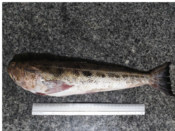
Fig. 1. Trachinus araneus (♀ 47.3 cm TL) caught in Oran Bay, (Photo: Lotfi BENSAPHLA TALET)

The specimen was identified using FAO species identification sheets (BAUCHOT and HUREAU, 1986; DJABALI et al. , 1993) on the basis of the following morphological characters: the body elongated and compressed; very small eyes located