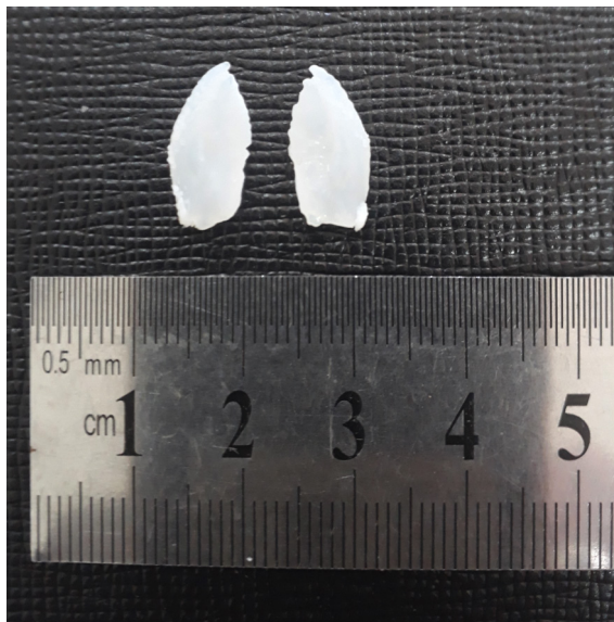
Fig. 3. Otoliths of T. araneus caught in Oran Bay