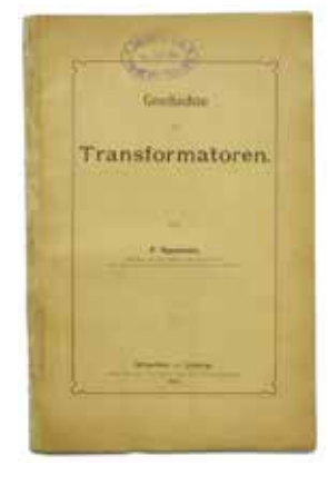
Figure 1. History of the transformers, F. Uppenborn

F. Uppenborn, Geschichte der Transformatoren (History of the transformers), de Gruyter, Munich - Leipzig, Pages 60, 1888; Reprint 2019; <u>Reprint 2020</u> [11]