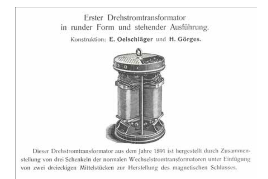
Figure 2. A three-phase transformer

Heinrich Kratzert, Grundriss der Elektrotechnik: Für den praktischen Gebrauch, für Studierende der Elektrotechnik und zum Selbststudium T. 2: Transformatoren, Akkumulatoren, elektrische Beleuchtung und Kraftübertragung mit besonderer Berücksichtigung der elektrischen Eisenbahnen (Basics of electrical engineering: For practical use, for students of electrical engineering and for self-study T. 2: Transformers, accumulators, electrical lighting and power transmission with special consideration of the electri-