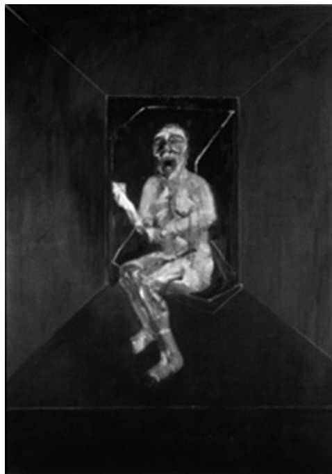
Francis Bacon, Study for the Nurse in the film The Battleship Potemkin , 1957, Oil on canvas

French expressionist painter George Rouault considers the dark side of both human soul and civilization. But this French painter is the prophet of “Victory over the Lucifer’s sun” (George Bernanos). In his religious subject matters Rouault is never too pathetic; although his colouring suggests doom aggression, French painter advocates the new odd world; the world whose fundamental aspects are pearls of Christian faith. In that sense Rouault is highly inspired with medieval art, especially with those of gothic heritage. His canvases with thick dense colour layers of figures are framed with steel-like contours. Figurative painting of this “last religious painter” reveals space of illuminating colours perpetuated with personal transcendental beliefs. Rouault’s artistic understanding is far away from the mere rebellion but it is rather derived from artist’s deep religious contemplation which gives his painting a metaphysical sublime.