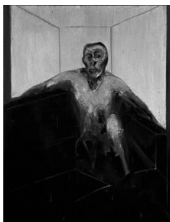
Study for a Portrait of P.L., n°2, 1957

Their limbic and massacred body structure turns into interlude imbued parts which merge in waving forms of slight strokes of brushwork. Yet, Bacon's colouring is varying; in some early works it is firm and expressive but in some other late works, the colour is lighter, more gentle and subtle.