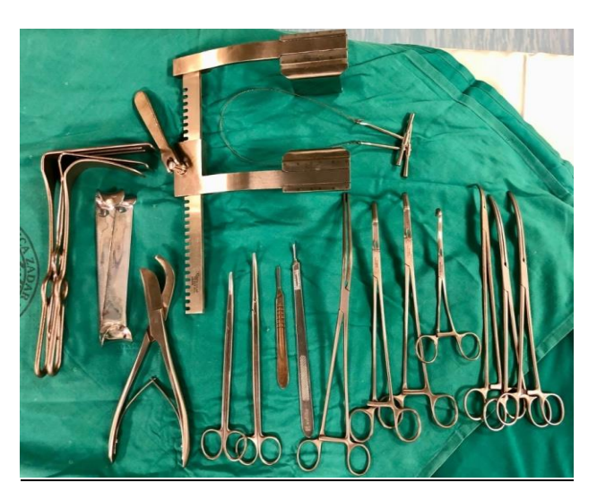
Picture 3 Key instruments for the EDT/EDS Slika 3. Osnovni instrumentarij za hitnu sternotomiju/torakotomiju

slower, but provides a better visualization of the heart and mediastinal contents, as well as both pleural contents. In our case, sternotomy was chosen due to the right parasternal position of the wound. Basic thoracotomy set readily available in the Emergency Department, Intensive Care Unit or in the Emergency OR is the prerequisite for the procedure (Picture 3). The team involved in the procedure should be protected against exposure to blood and sharp objects, therefore it is recommended to wear sterile gloves, gown and face shield. Surgery requires skin antiseptic, sterile drapes, scalpel, sternum saw, heavy trauma scissors, Gigli saw or Lebsche knife, heavy wound retractor, lung retractor or lung clamps, vasculars clamps, potent suction device, needleholder and appropriate suturing material e.g. polypropylene 3-0. Additional material may be required at the end of the successful surgery e.g. pericardial and thoracic drains and wire sutures for sternotomy closure.