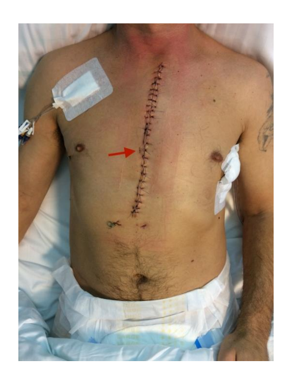
Picture 2 The patient after surgery with the red arrow pointing to the wound entry site Slika 2. Bolesnik nakon operacije – crvena strelica pokazuje mjesto penetrantne rane.

EKG showed electrical activity with bradycardia but still without palpable pulse over the carotid arteries. An sternotomy emergency room was decided. The Emergency asepsis was accomplished with alcohol splash and sternotomy was performed using a scalpel for skin incision and a pair of heavy trauma scissors for cutting through the sternum. The knife was removed when interfered with access to the heart. During the sternotomy, the anesthetist noticed ventricular fibrillation on ECG. In the absence of wound retractor, the nearest medical technician held one side of the wound and a surgical assistant was pulled the other side. The exposed pericardium appeared tense and ballooned. Pericardiotomy released the heart tamponade which was causing circulatory collapse. Immediately after decompression, the heart started slowly pumping out blood through the 8 mm hole in the right ventricle where the tip of the knife had been inserted. Blood clots were removed with