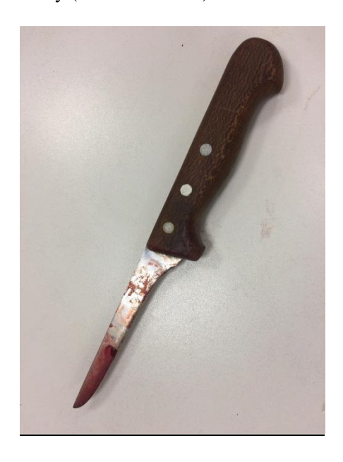
Picture 1 The knife after extraction. Slika 1. Nož nakon odstranjenja.

In the evening hours, an ambulance brought in a 45-years-old male to the Emergency Department (ED) with a knife stabbed in his chest. According to the ambulance staff, the patient stopped breathing at the hospital gate so ventilation with laryngeal mask was performed. The patient's face was covered in vomit, and he was pulseless and cyanotic at arrival. The anesthetist intubated him immediately. The patient's chest was exposed with a carving knife protruding parasternal right at the middle of the sternum body (Picture 1 and 2).