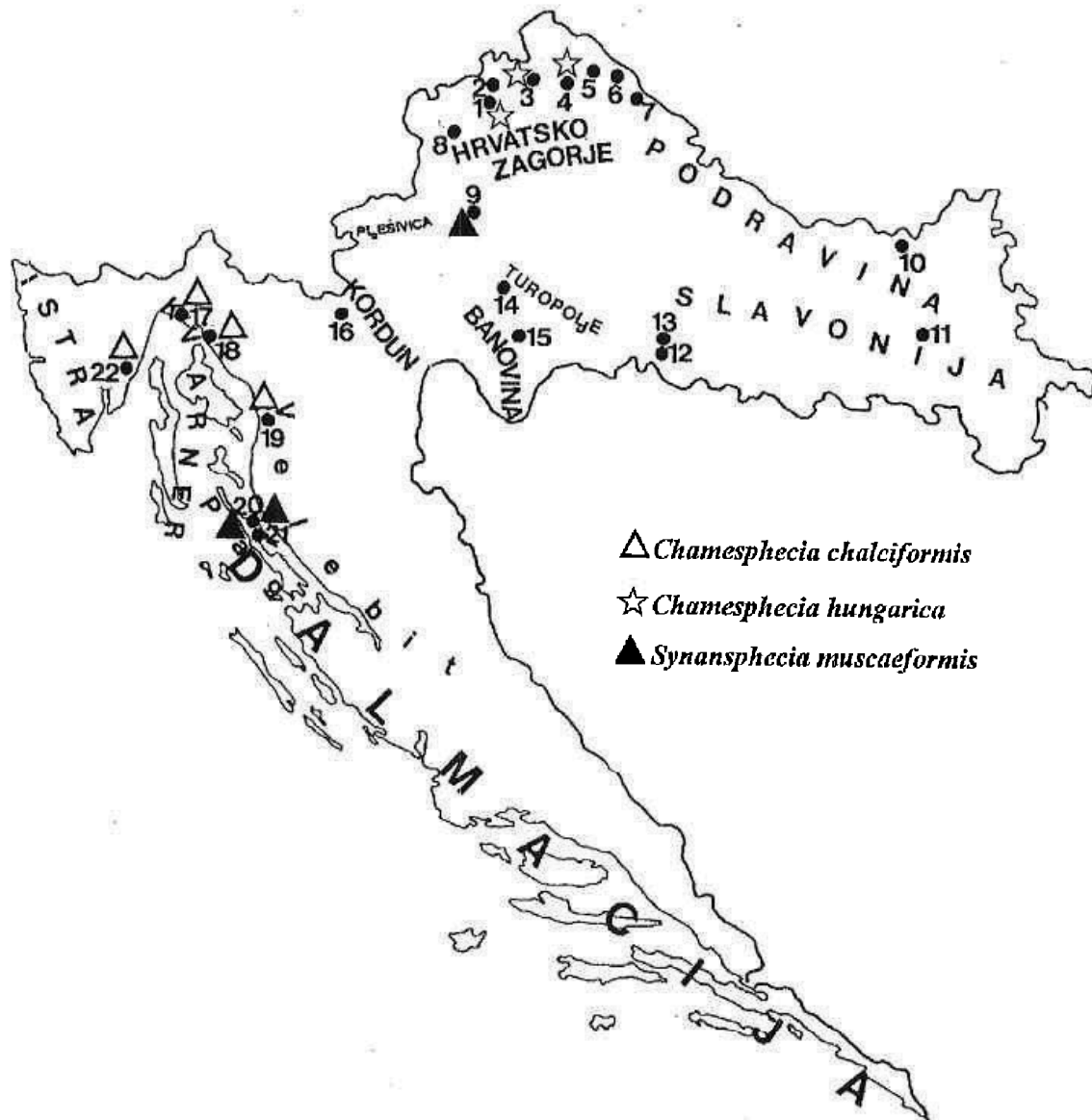
Fig. 1. Map of Croatia with localities (1–Kamenica; 2–Ravna Gora; 3–Varaždin; 4–Delekovec; 5–Botovo; 6–Gabajeva Greda; 7–Repaš; 8–Trnovec; 9–Zagreb; 10–Boljara; 11–Spačva; 12–Opeke; 13–Novska; 14–Peščenica; 15–Petrinja; 16–Bosiljevo; 17–Rijeka; 18–Bakar; 19–Babrovača; 20–Caska; 21–Dubrave; 22–Vozilići) and distribution of Chamaesphecchia chalciformis Esp., Chamaesphecchia hungarica Tom. and Synansphecchia muscaeformis Esp.