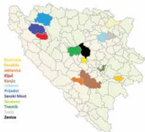
Figure 1. Sampling locations in territory of Bosnia and Herzegovina.

Chlamydiosis in dogs is disease caused by gram-negative, intracellular bacteria, which include strains: Chlamydomphila felis , Chlamydomphila abortus ,