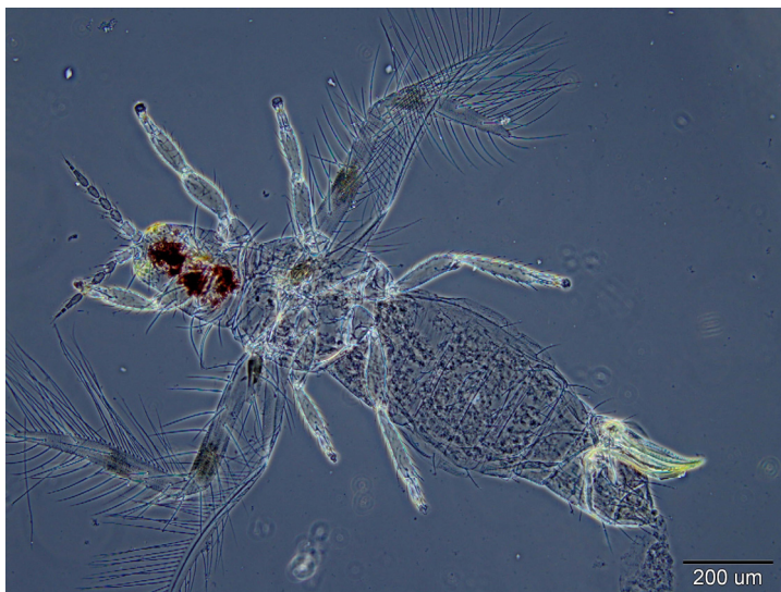
Figure 1 Microscopic slide of S. longicornis female Slika 1. Mikroskopski preparat ženke S. longicornis

Head is wider than it is long. Antennae are 8-segmented with a long forked sense cone on third and fourth segment (Figure 2). First two antennal segments are white, while others are pale yellow. Three pairs of ocellar setae are present on the head, of which the third pair is very long and arises on the anterior margin of the ocellar triangle (Figure 3). Postocular setae are small and the first pair behind the hind ocelli are close together. Pronotum has six pairs of very long setae (Figure 3). Paired postero-median discal setae are absent.