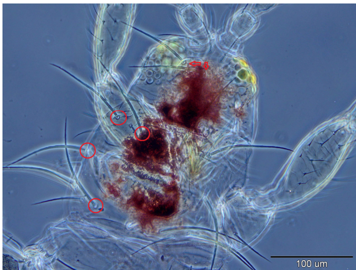
Figure 3 S. longicornis : pair III of ocellar setae (red arrows) and very long setae on pronotum (red circles)

Slika 3. S. longicornis : treći par ocelarnih čekinja (crvene strelice) i vrlo duge čekinje na pronotumu (crvene kružnice)