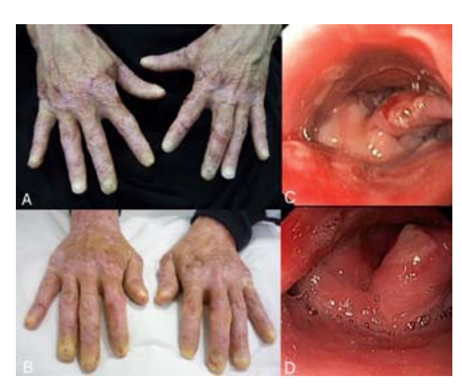
Figure 1. Response of epidermolysis bullosa acquisita (EBA) cutaneous manifestations before and after rituximab. a) Hands before ; b) Hands after ; c) Endoscopic view of arytenoid cartilages before ; d) Arytenoid cartilages after .

A 49-year-old man was diagnosed with EBA in 1994. His diagnosis was confirmed with a skin biopsy, direct and indirect immunofluorescence, and immunoblotting (1). Previous treatments included prednisone up to 200 mg/day, azathioprine, cyclosporine, dapsone, tetracyclines, photophoresis, and plasmapheresis. He was referred to our dermatology clinic in 2004 with a history of spontaneous blisters and extreme skin fragility especially on trauma-prone sites including the hands, feet, elbows, and knees. He suffered from the effects of extensive cutaneous and