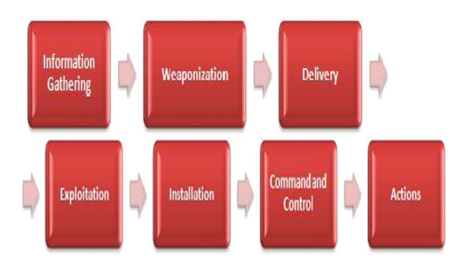
Figure 3. Intrusion Kill Chain.

of adversary conditions, stresses, or attacks on the cyber resources it needs to function.