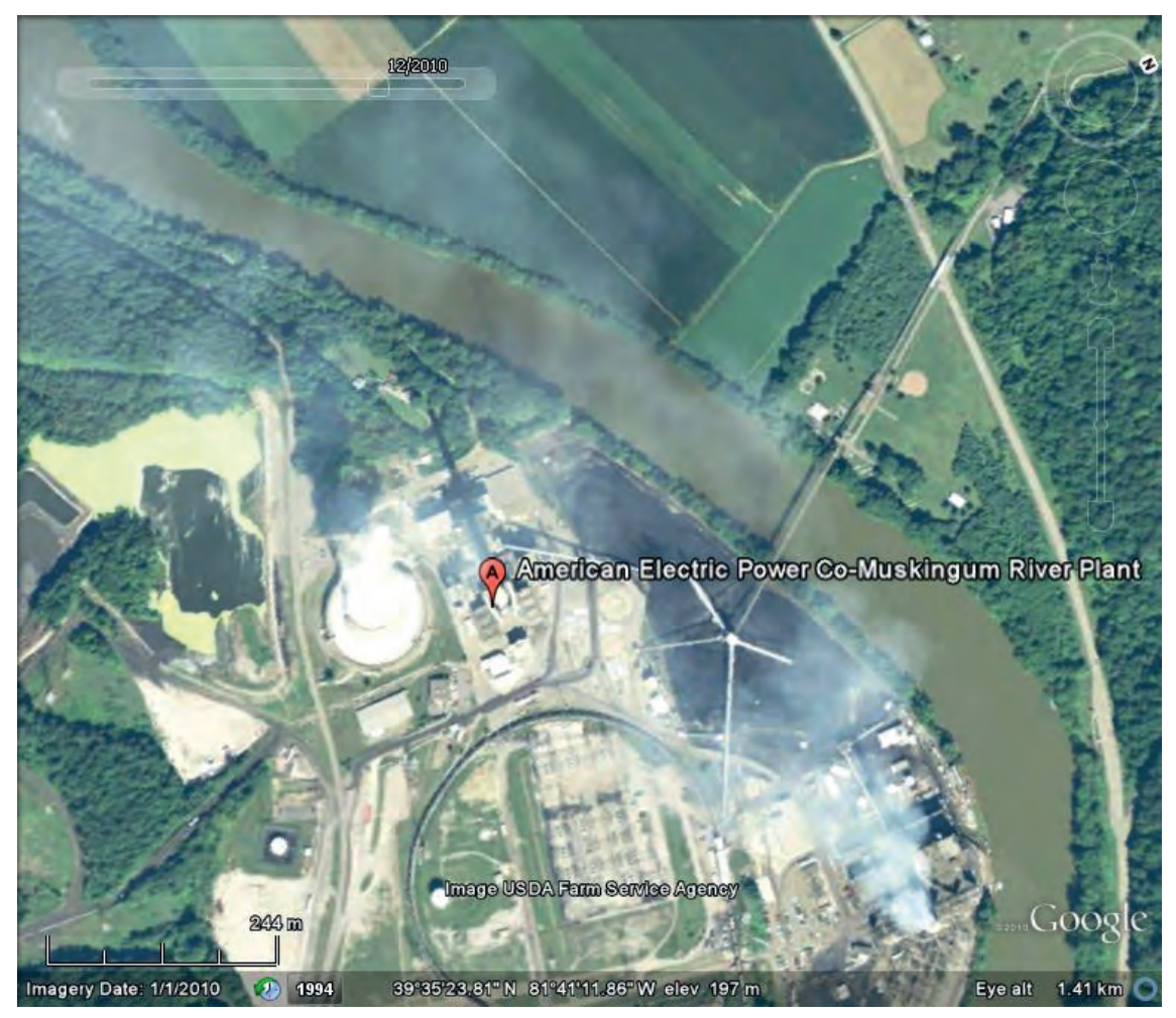
Figure 3. Satellite image of Muskingum River plant in 2010

Slika 3. Satelitska slika termoelektrane Muskingum River iz 2010. godine