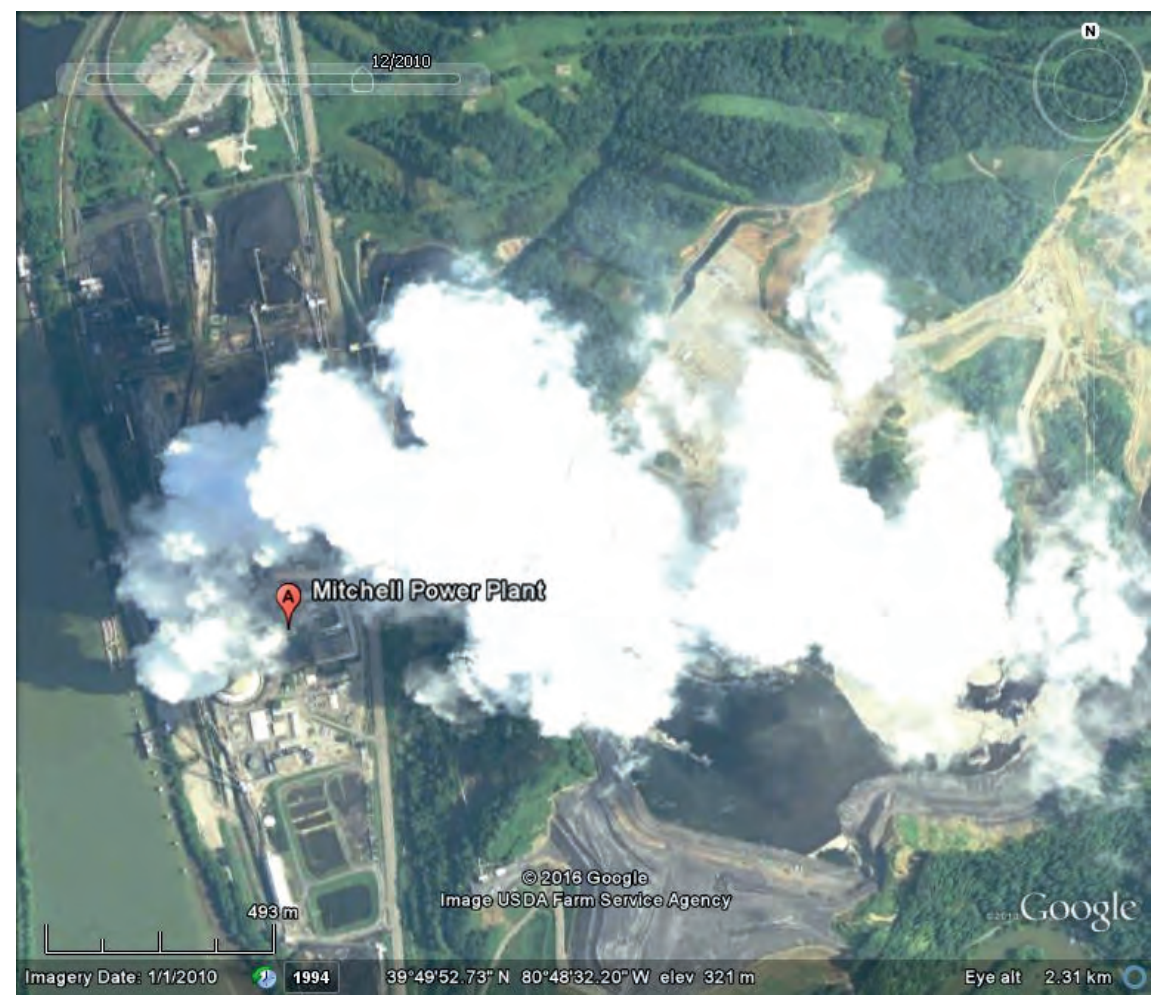
Figure 4. Satellite image of Mitchell plant in 2010Slika 4. Satelitska slika termoelektrane Mitchell iz 2010. godine

where C is the pollutant concentration (gr/m^3) , x, y and z are the coordinates in the