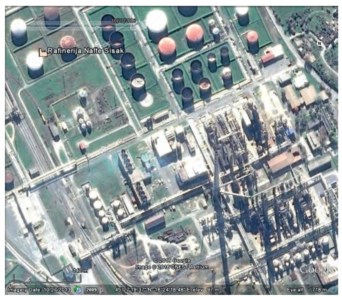
Figure 6. Satellite image of Sisak oil refinery in 2013Slika 6. Satelitska slika Rafinerije nafte Sisak iz 2013. godine