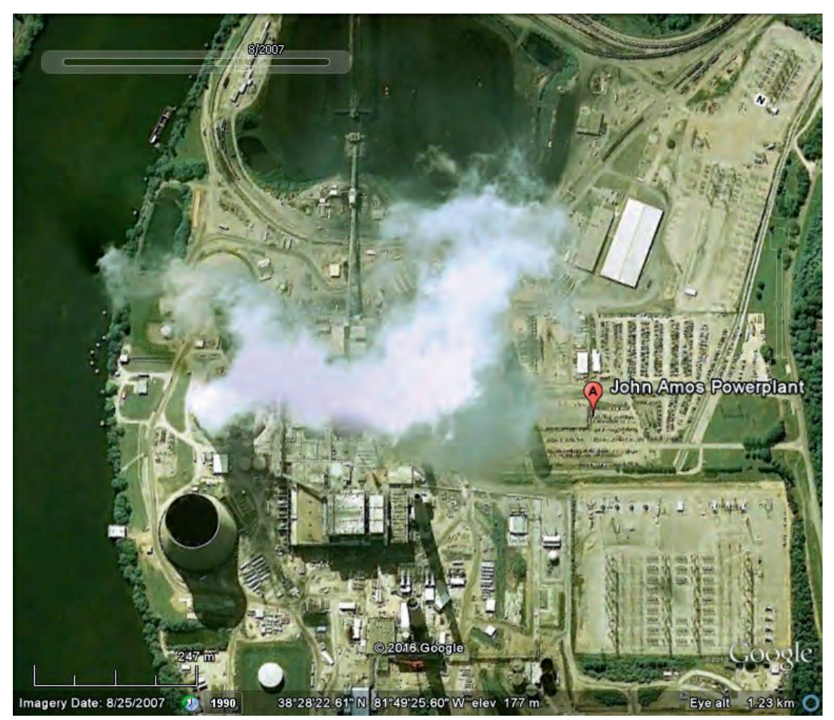
Figure 2. Satellite image of Amos plant in 2007Slika 2. Satelitska slika termoelektrane John E. Amos iz 2007. Godine.