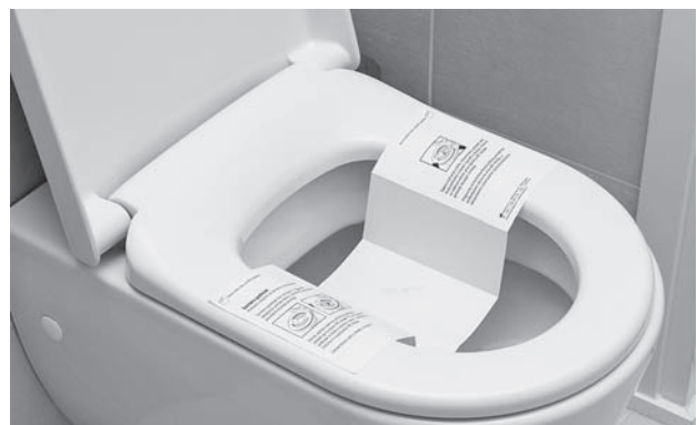
Figure 3. toilet-seat napkin for easy stool sampling