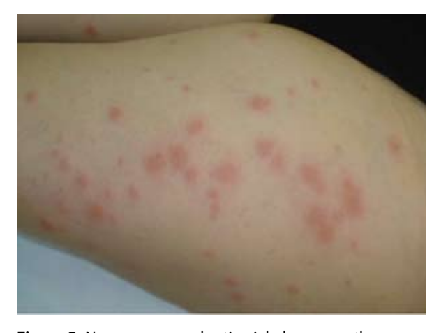
Figure 2. Numerous round urticarial plaques on the thighs.

Gestational pemphigoid, originally misnamed herpes gestationis, is a rare autoimmune bullous dermatosis in pregnancy. Single cases have been also described in patients with molar pregnancies and trophoblastic tumors (1). Its etiology is based in the development of autoantibodies against the fetoplacental unit, triggering an autoimmune response against both skin and amnion hemidesmosomal proteins, mainly BP180, but also BP230 and type VII collagen. An association with HLA-DR3 and HLA-DR4 has been described (2).