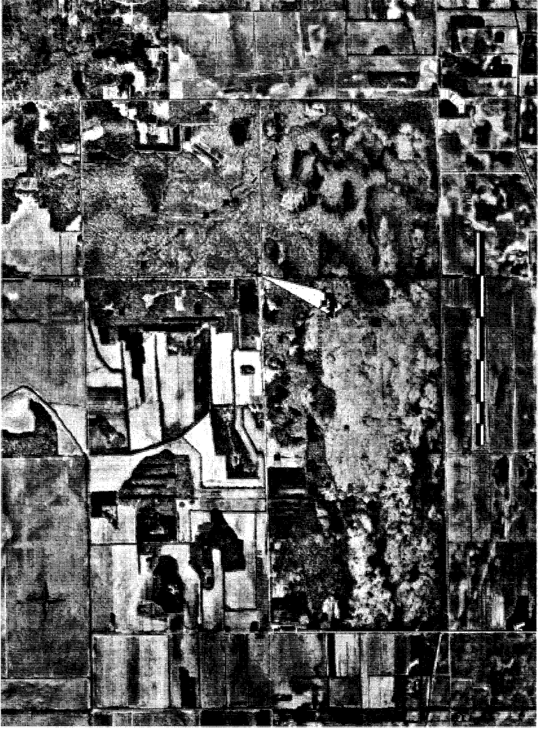
Figure 1. Locations, movements, and home range of ornate box turtles at Iroquois State Wildlife Area (yellow outline) and Hooper Branch Savanna (red outline), May to July 2003. Triangles are turtle 1L, squares are turtle 2L. The white blocked area indicates 1L's home range. Major county roads are marked for reference. Turtle 2L's pick up and relocation points are also marked.