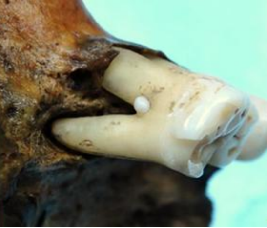
Figure 1. Right maxillary posterior region of female individual exhibiting advanced bone loss, furcation involvement and root approximation of tooth 16. Enamel pearl is identified in the furcation area (arrow indicates the enamel pearl between DB and P roots). Linear enamel hypoplasia of 16 and 13 is also evident (red arrows).

anatomical location of enamel pearls for the maxillary first and second molars, being the