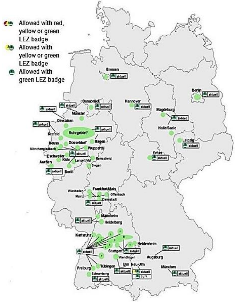
Figure 3 Low emission zones in Germany [22]

In Fig. 3, different LEZs in Germany (in 2014) are presented. More than 70 German cities have one kind of a LEZ. Almost all of them are ranked in the environmentally friendly green class. Some crucial findings can be obtained when analyzing Fig. 3.