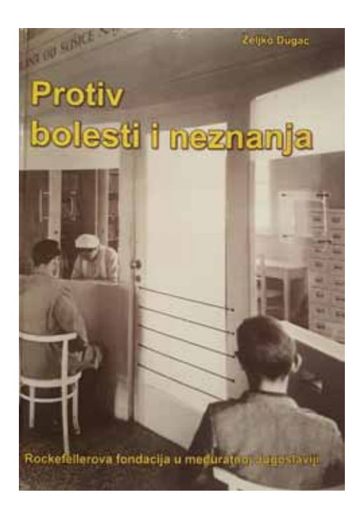
Figure 2. Protiv bolesti i neznanja: Rockefellerova fondacija u međuratnoj Jugoslaviji (Against the disease and ignorance: The Rockefeller Foundation in interwar Yugoslavia). Zagreb: Srednja Europa, 2005.

In Protiv bolesti i neznanja: Rockefellerova fondacija u međuratnoj Jugoslaviji (Against the disease and ignorance: The Rockefeller Foundation in interwar Yugoslavia; Zagreb, Srednja Europa, 2005), Dugac examined new medical policies, institutions, and practices developed in the Kingdom of the Serbs, Croats, and Slovenes/Yugoslavia after 1918, that emphasized public health and prevention of disease. Croatian physician, Andrija Štampar (1888-1958), who is heavily represented in all three books, was the central figure of this enterprise, both as a developer of the ideas of modern public health in Yugoslavia and, even more importantly, as a main collaborator of the Rockefeller Foundation in Yugoslavia, whose funding was instrumental in realization of Štampar's ideas.