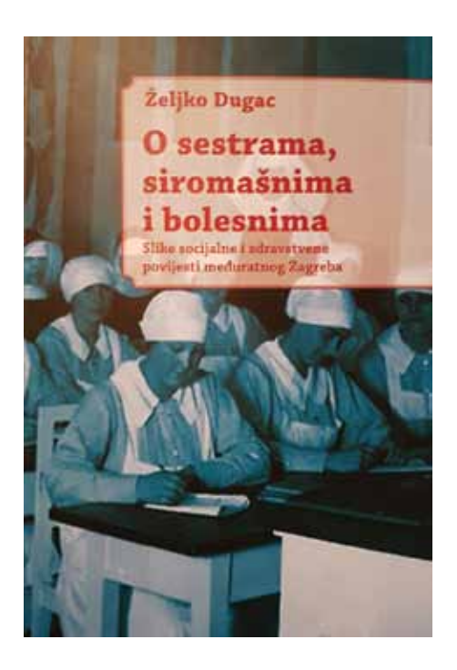
Figure 1. O sestrama, siromašnima i bolesnima: Slike socijalne i zdravstvene povijesti međuratnog Zagreba (On nurses, poor, and sick: Instances from the social and medical history of interwar Zagreb). Zagreb: Srednja Europa, 2015.

The 2015 book O sestrama, siromašnima i bolesnima: Slike socijalne i zdravstvene pov ijesti međuratnog Zagreba (On nurses, poor, and sick: Instances from the social and medical history of interwar Zagreb), by Željko Dugac, is the final installation of a trilogy on the history of public and social medicine in interwar Yugoslavia. The three books have addressed a similar set of questions on three interconnected levels: interwar Yugoslavia, Croatia, and the city of Zagreb.