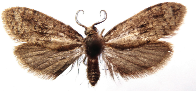
Fig. 2. Male of Penestoglossa dardoinella (Millière, 1863) from S Black Sea Coast –Mt. Strandzha, Papiya Hill above Brodilovo village, 370 m.

Strymon-Delta, 1 km S Nea Kerdilia, 2 m, N40°48', E23°51', 26.viii.1983, 1 ♂, leg. H. Hacker, LF (MWM)