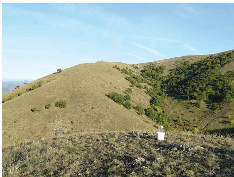
Fig. 5. Habitat of Eochorica balcanica (Rebel, 1919) at Preševo town municipality, 2 km W from Trnava village, 696 m, September 2015.

Babuna Mts, Prilep district, near Pletvar Pass, above Trojanci village, 740 m, N41°23'07", E021°43'31", 8.ix.1997, 3 ♂♂, dry limestone mountain slopes with Quercus forest around, leg. S. Beshkov & V. Gashtarov, lamp and light trap