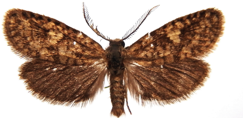
Fig. 4. Male of Eochorica balcanica (Rebel, 1919) from Preševo town municipality, 2 km W from Trnava village, 696 m.

Vardar river valley, Demir Kapija Gorge, 100 m, N41°24'23", E022°16'06", 7.ix.1997, 1 ♂, river valley with Platanus orientalis in limestone gorge, leg. S. Beshkov & V. Gashtarov, lamp and light trap