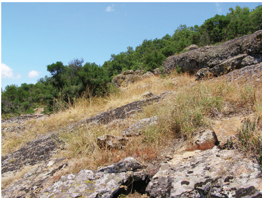
Fig. 3. Habitat of Penestoglossa dardoinella (Millière, 1863) at S Black Sea Coast –Mt. Strandzha, Papiya Hill above Brodilovo village, 370 m, July 2008.