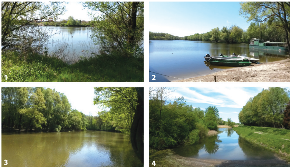
Fig. 2. Habitats where caddisflies were collected in Kopački rit Nature Park: 1) lower reach of the Drava River, 2) the eutrophic Lake Sakadaš, 3) Vemeljski dunavac, 4) Čarna channel.