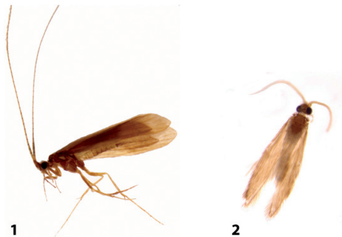
Fig. 3. Adult males of 1) Oecetis furva and 2) Orthotrichia tragetti collected in Kopački rit Nature Park. Body sizes are not shown to scale; on average O. furva males are 7-8 mm, and O. tragetti males 2.5-3 mm long.

In general, dwellers of potamal river sections like Leptoceridae are widely distributed (GRAF et al. , 2008). O. furva is found all over Europe with the exception of the Iberian Peninsula and some regions in France and the Western Balkans (GRAF et al. , 2008, 2016). In some ecoregions it is considered rare (ER 20, Borealic Uplands, sensu ILLIES 1978) and it is red-listed in several countries (Sweden, Norway; GRAF et al. , 2008, 2016). It is rare, but possibly also overlooked because its typical habitats are rarely investigated (GULLEFORS, 1988). In Croatia it has most likely not been recorded simply because its typical