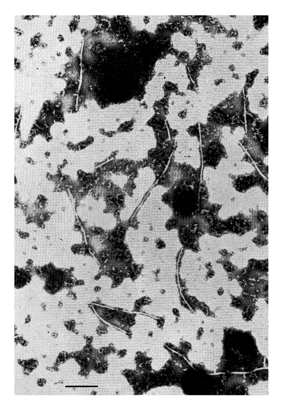
Fig. 2. — Sl. 2.