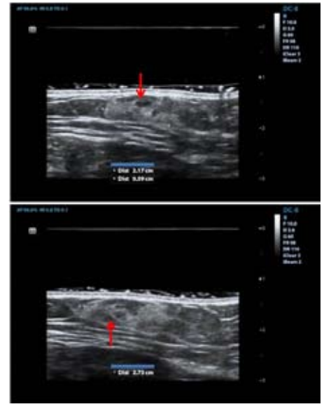
Figure 1. Ultrasound scan of subcutaneous cavernous angiolipoma: a non-homogeneous sonographic appearance due to vascular lacunae engorged by blood (red arrows), is noticeable.

For the first time in the literature, we report a case of subcutaneous cavernous angiolipoma. This new soft-tissue entity should be reserved for subcutaneous angiolipoma with very large vascular gaps, haphazardly arranged and engorged by blood. The first and only description of a cavernous angiolipoma dates back to 2008, when Farooq and collegues described