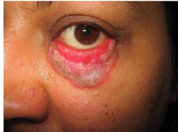
Figure 2. Semi-annular erythematous plaque with scales and follicular plugging.