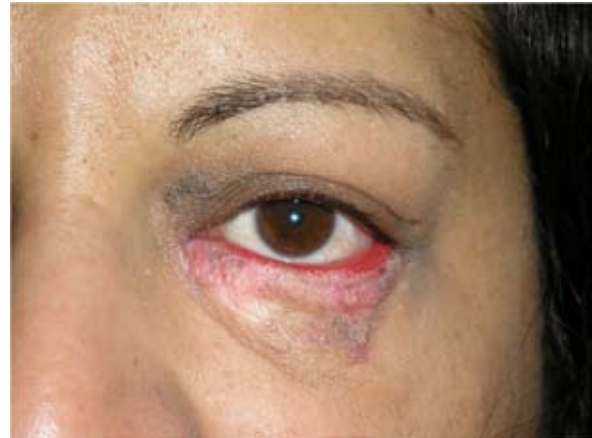
Figure 5. Post treatment: Persistent loss of eyelashes.

A large group of diseases should be considered in differential diagnosis of DLE, including psoriasis, seborrheic and atopic dermatitis, and polymorphic light eruption (7). DLE could be suspected in cases of therapy-resistant and persisting inflammatory eyelid lesions (8). The non-specific changes in our case require further investigation to exclude autoimmune and proliferative skin diseases. Reaching the right di-