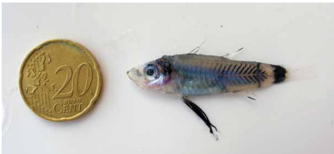
Fig. 1. The specimen of Microichthys sanzoi (TL = 51.1 mm) found stranded on shore of the Strait of Messina on 29 th March 2013

this species and allows to deepen the current knowledge on the morphology of its sagittal otoliths.