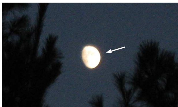
Figure 1: Photograph of the moon tilt illusion. Picture taken one hour after sunset, with the moon in the southeast and sun already set in the west. Camera pointed upwards 45^\circ from the horizon with bottom of camera parallel to the horizon.

The photograph in Figure 1 provides an example of the moon tilt illusion. The moon's illumination is observed to be coming from above, even though the moon is high in the sky and the sun had set in the west one hour before this photo was taken. The moon is 45^\circ above the horizon in the southeast, 80% illuminated by light from the sun striking the moon at an angle of 17^\circ above the horizontal, as shown by the arrow drawn on the photograph. Our intuition (i.e., the incorrect perception that creates the illusion) is that given the relative positions of the sun and the moon, the light from the sun should be striking the moon from below. The moon tilt illusion is thus the perceived discrepancy between the angle of illumination of the moon that we observe (and can capture photographically with a camera pointed at the moon) and the angle that we expect, based on the known locations of the sun and the moon in the sky.