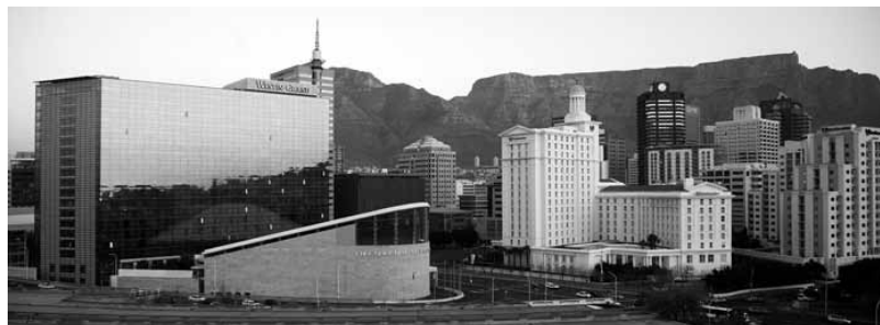
CTICC: Venue for 19th IFAC World Congress, Cape Town, South Africa