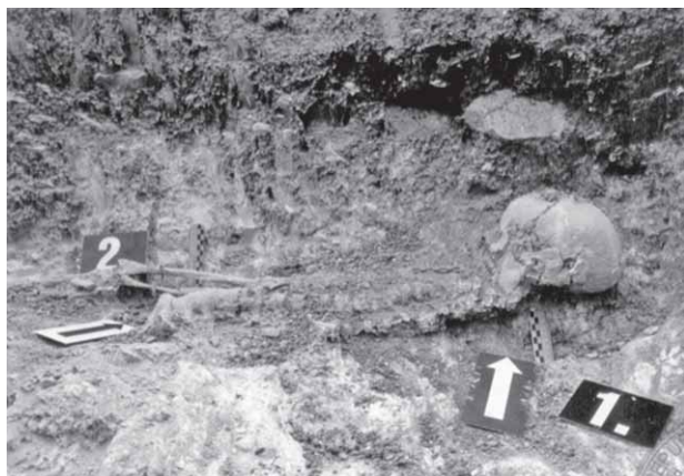
Fig. 2. Skeletal remain found in the clay ground, at the northern part of Split.