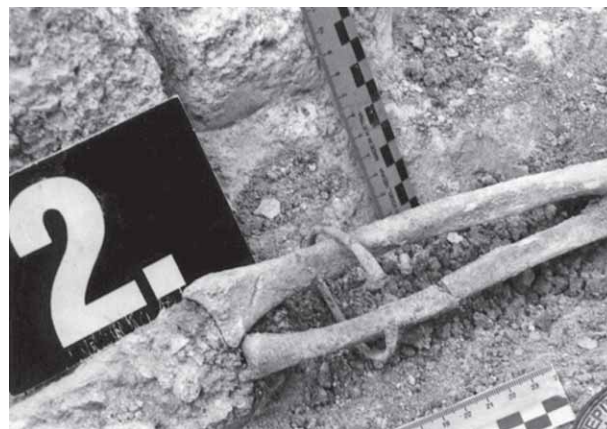
Fig. 3. The metal ring on the right skeletal remains hand, with open ends, which characterized aristocracy.

Archaeological and forensic tests showed that the skeletal remains belonged to the male person which was subsequently confirmed by nuclear DNA analysis using Profiler Plus Amplification Kit (Table 1). It contains specific primers for amplification of amelogenin gene thus allowing sex determination since the X chromosome gene, AMELX, gives rise to a 106 bp amplification product (amplicon) and the Y chromosome gene, AMELY, a 112 bp amplicon 12 .