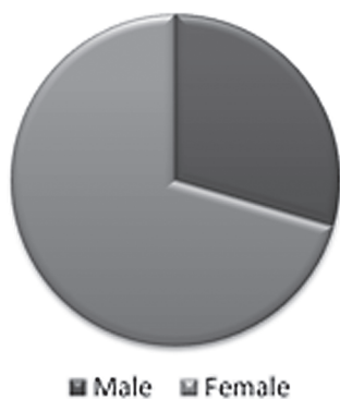
Fig. 1. Showing analysis of subjects according to sex.

The analysis of all subjects according to sex reveals a prominent dominance of the female sex compared to the male (70.5% vs. 29.5 %, RR = 2.386 , 95% CI 1.811–3.169, p < 0.001 ) (Figure 1). Distribution of patients according to age shows the highest incidence of neuralgia at the age of 61 to 71 (24.5%, p < 0.001 compared to the expected rate of 11.5%) (Table 1). Analyzing the information about the season of referral, it has been perceived that there is no significant difference between winter and summer months (24.9% vs. 24.5%, RR = 1.017 , 95% CI 0.707–1.464, p = 0.926 ) (Figure 2).