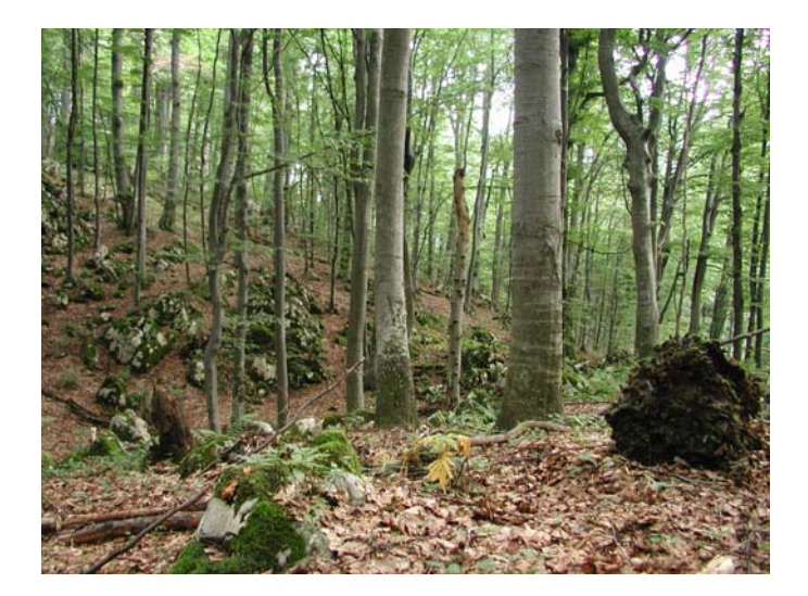
Figure 3. Stand of montane beech forest in Kuta, habitat of S. atra .

Slika 3. Sastojina planinske bukove prašume u području Kute (Žumberak), stanište vrste S. atra.