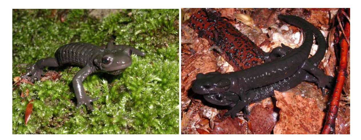
Figure 2. Alpine salamander ( Salamandra atra ) found in the virgin beech forest Kuta on 27<sup>th</sup> June 2004 (male - left, amplexus - right).

known locality Pogana jama, which is actually a stratified cave that serves as a permanent swallow hole for surface waters (BUZJAK, 2002). Both our and KLETEČKI (1990) findings enabled us to identify the smallest probable area of distribution for Alpine salamander in the Nature Park (Figure 1b). The area above 800 m a.s.l. where montane beech forests from association Lamio orvalae – Fagetum sylvaticae are prevalent, represent potential habitat for this species.