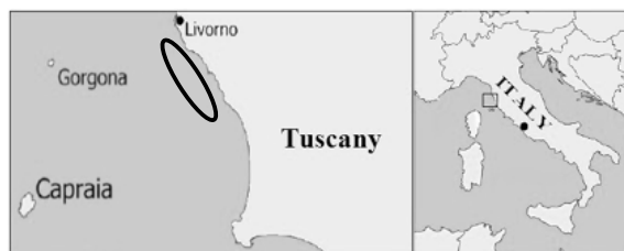
Figure 1. Map of the northern coast of Tuscany. The ellipse indicates the study area.

The study was carried out off the coast of Tuscany (northwestern Mediterranean Sea) in 2007 (Fig. 1). At the study sites, Posidonia oceanica meadows colonized a rocky bottom. Three depth ranges were considered: 8-10 m (shallow), 15-17 m (intermediate) and 23-25 m (deep). Two periods were chosen over one year: spring-summer (s-s) and autumn-winter (a-w); these correspond to periods during which P. oceanica meadows have different structural characteristics (MAZZELLA & OTT, 1984). Two random