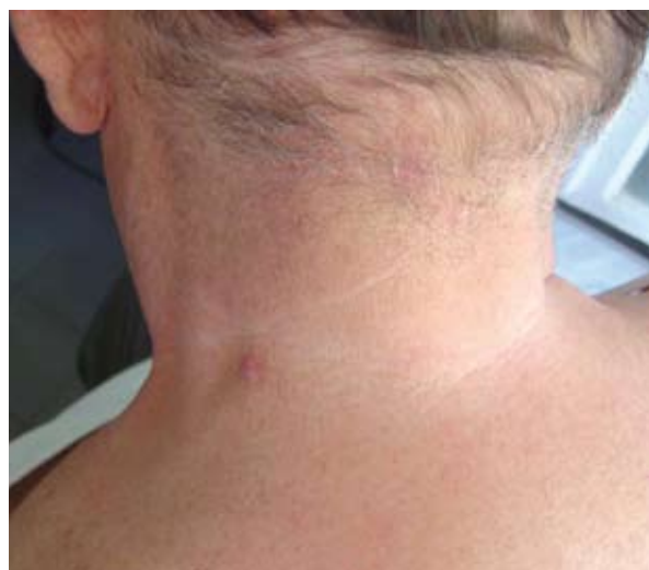
Figure 1. Porokeratotic lesion in the nuchal region, after biopsy.