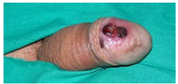
Figure 1. Non-homogenous, brown-black tumor measuring 20x10 mm, located on glans penis.

brown-black color and comparatively smooth but firm surface (Fig. 1). Another mobile rounded lesion of 5x6 mm in dimension and bluish color was found on the inner preputial surface.