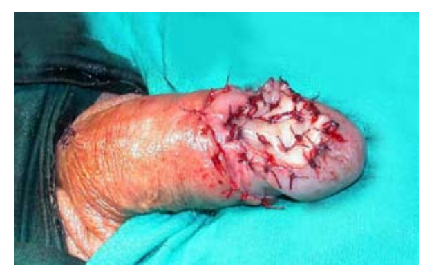
Figure 3. Buccal mucosa graft for covering the defect on glans penis.

raphy (US) of pelvic and abdominal area did not reveal any pathologic signs. Colloid scintigraphy of inguinal lymph nodes revealed a single zone of increased activity in the left inguino-femoral area.