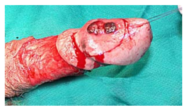
Figure 2. Partial glansectomy with circumscision in healthy tissue.

On palpation of lymph nodes in the left inguinal area, a slightly enlarged lymph node measuring 10x12 mm and suspect of metastasis was found. Computer axial tomography (CAT) and ultrasonog-