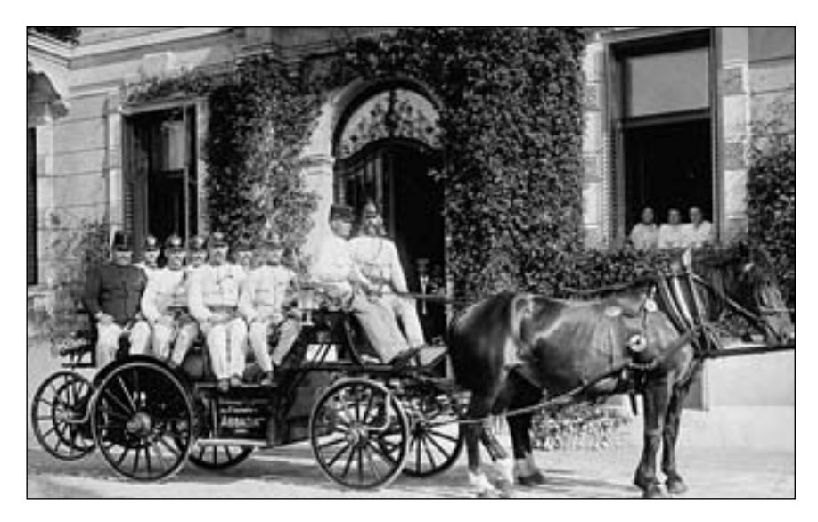
Figure 1 The Health Resort Opatija Volunteer Fire Brigade (The Fire Brigade Museum named after dr. Branko Božič – Slovenski gasilski muzej dr. Branka Božiča in Metlika)