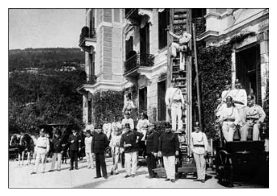
Figure 5 The Health Resort Opatija Volunteer Fire Brigade and Rescue Society (The Fire Brigade Museum named after dr. Branko Božič - Slovenski gasilski muzej dr. Branka Božiča in Metlika)