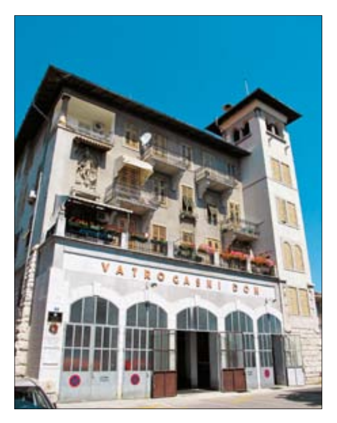
Figure 7 Nowadays, the Opatija Volunteer Fire Brigade has still been positioned in the original premises built already in 1910.

Slika 7. Dom vatrogasnog i spasavajućeg društva lječilišta Opatija, izgrađen 1910., i danas upotrebljavaju dobrovoljni vatrogasci.