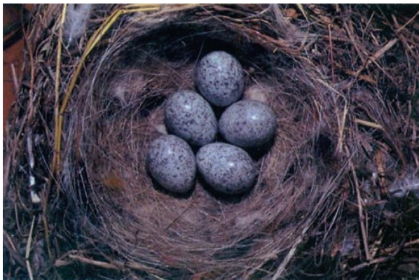
Fig. 2. Clutch of pied wagtail ( Motacilla alba ) with five eggs