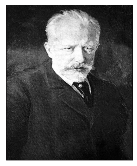
Oil portrait of the composer P. I. Tchaikovsky's (1840 – 1893), painted by N. D. Kuznecov in 1883.

N. D. Kuznjecov: Portret P. I. Čajkovskog (1840.–1893.), ulje na platnu, 1883.