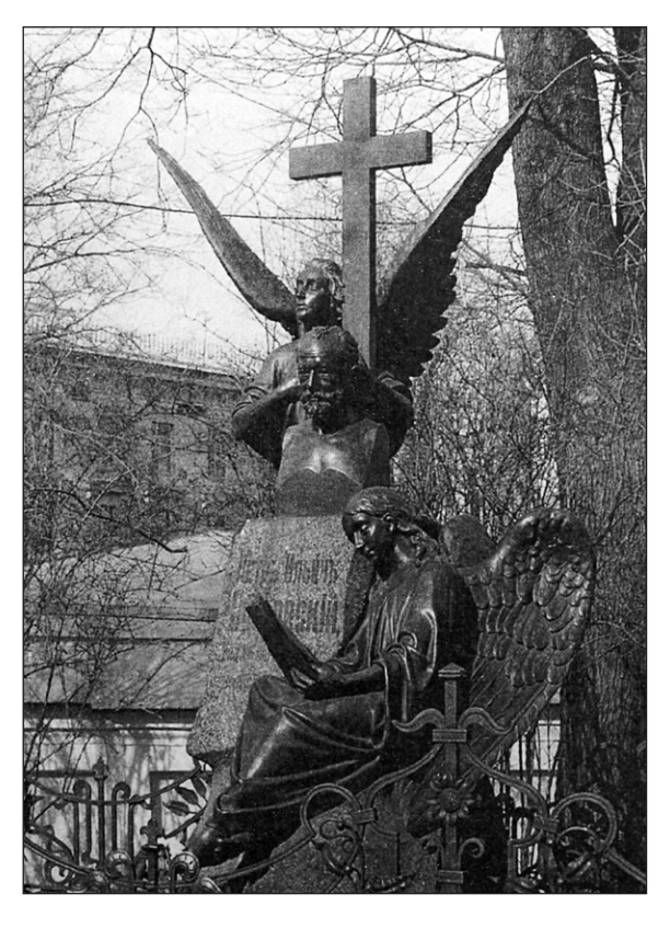
Tchaikovsky's tombstone in Saint Petersburg cemetery. Nadgrobni spomenik P. I. Čaikovskom na