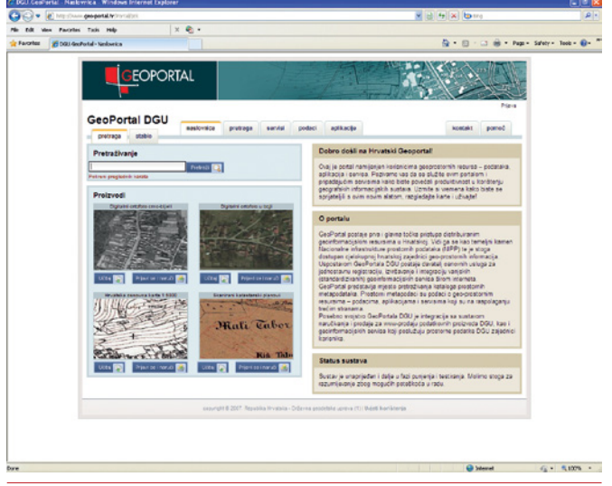
FIGURE 2. SGA Geoportal (www.geo-portal.hr)

Having a geoportal in operation means that other governmental organizations can not only use SGA data but also make their data accessible. Through SGA geoportal Croatian GIS users have access to vast quantities of spatial data that will make their everyday work much easier. This is the first step to the establishment of a Croatian national geoportal as part of an NSDI.