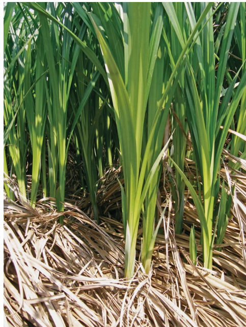
Fig. 3. Lower parts of stems of Carex randalpina B. Walln.

Physiognomically, this is dense vegetation with a height of about 1 m and more (Fig. 2). Cover values range between 90 and 100% (Tab. 1). The species Carex randalpina , as compared to all other big sedges in Croatia, is relatively identifiable by its light green, shining leaves, up to 18 mm wide (Fig. 3); large spikelets, which are