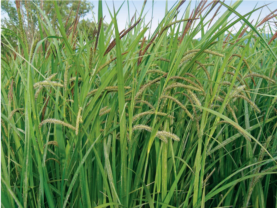
Fig. 4. Specimens of Carex randalpina B. Walln. in inflorescens.

pendulous because of their size (Fig. 4); and by the underground rhizomes, in the fresh state up to 7 mm across (Fig. 5); and roots from 1 to 4 mm thick (Fig. 5). Nevertheless, during any determination it has to be borne in mind that there are also hybrids ( C. xoenensis , C. xoberrodensis ), although they have not as yet been established for the Croatian flora.