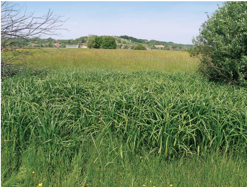
Fig. 2. Association Filipendulo ulmariae-Caricetum randalpinae ass. nov. hoc loco in habitat in Luka on 13/05/2006 (relevé 6).

(WALLNÖFER, 1993). Furthermore, in the Isar river valley north of Munich in Germany, where SEIBERT (1962) for the first time provisionally described the association Caricetum oenensis , in accordance with WALLNÖFER (1993, 1994) there were recorded both taxa Carex randalpina and C. xoenensis . At the present state of knowledge, it is not possible to establish to which taxon belongs the Carex species recorded in the original phytosociological table published by SEIBERT (1962). In order to avoid further ambiguities, on one hand due to invalid publication of the association's name, and on the other hand due to lack of data on which of the two related Carex species in the association described by SEIBERT (1962) the exemplars belong to, here is described the new association.