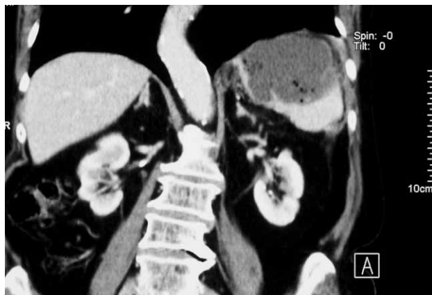
Fig. 2. CT finding (with intravenous contrast): by lateral pole of spleen there is an aero-liquid collection, coefficient absorption 20 HU that can not be imbibed with a contrast, dimension 13 × 7 cm which indicates formed spleen abscess.