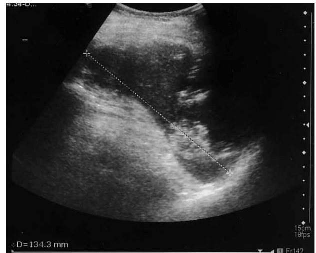
Fig. 1. Ultrasonography of spleen: shows enlarged spleen with collection of necrotic material in the upper pole with the diameter of 13.4 cm.

We report unusual case of spleen abscess caused by left surgical gauze. One night, a 73-year old woman was admitted to our hospital with fever (38.7°C) and strong pain in left upper abdominal quadrant. Routine laboratory testing revealed leukocytes number count 16.2 \times 10^9/L (normal 3.4-9.7 \times 10^9/L ) and CRP 162 mg/L (normal <5.0 mg/L). Standard abdominal X-ray didn't suggest any findings, but abdominal ultrasonography (Figure 1) and CT (Figure 2) showed left subfrenical dense collection adjacent to spleen. Under the impression of intra-abdominal abscess and positive acute abdominal signs, exploratory laparotomy was performed. At laparotomy focal abscess on upper spleen pole was found. After cap-