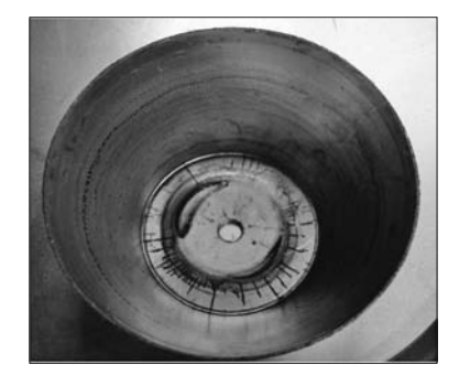
Figure 5. Finished draw piece